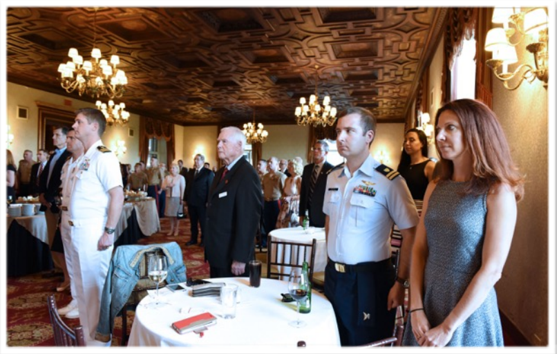
Members and guests at the Richard W. Scheuing CO/XO Reception.