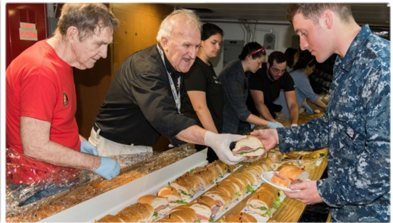
Volunteers from the New York Council, American Legion 9/11 Post, Intrepid Former Sailors, Tin Can Sailors and Susan E Wagner Class of 2016 served hungry crews in Manhattan, Brooklyn and Staten Island.